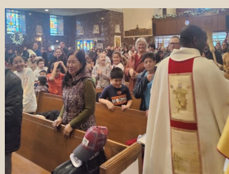
of Our Lord Jesus Christ.